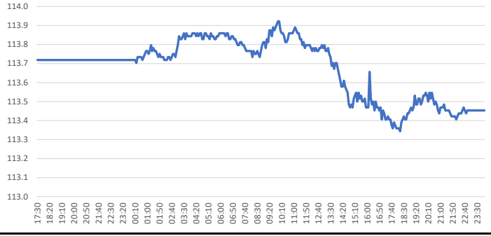
10-Year US Treasury Future