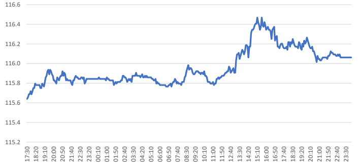
10-Year US Treasury Future