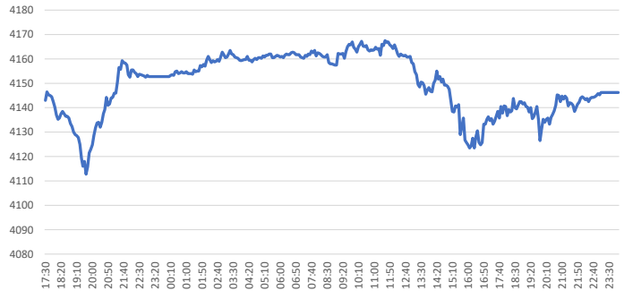
S&P 500 Future