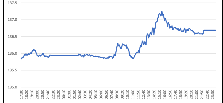
10-Year Bund Future