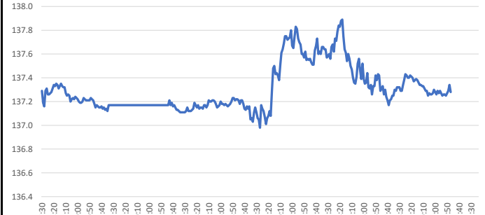
10-Year Bund Future