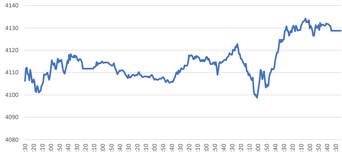
S&P 500 Future