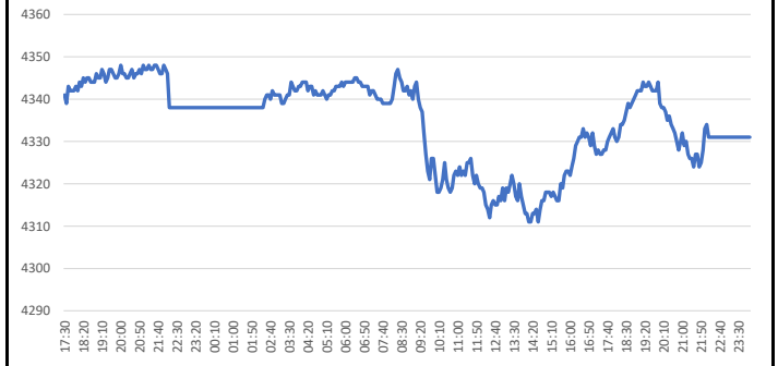
EURO STOXX 50 Future