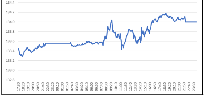
10-Year Bund Future