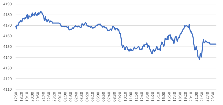
S&P 500 Future