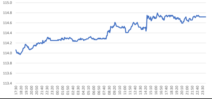
10-Year US Treasury Future