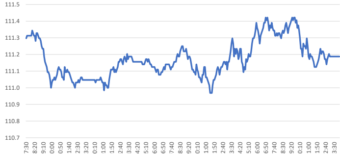
10-Year US Treasury Future