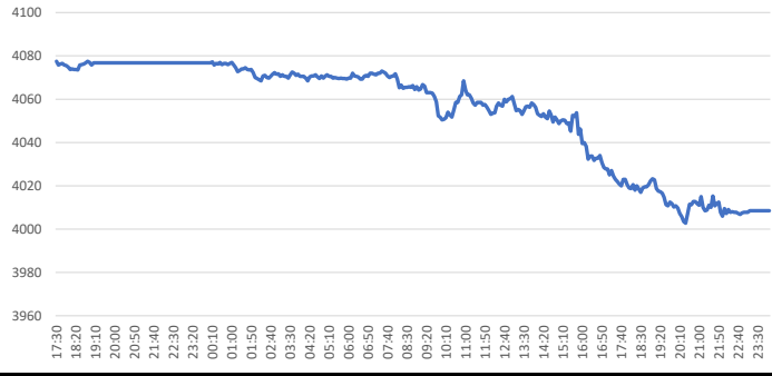
S&P 500 Future