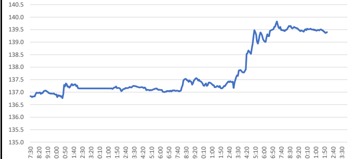
10-Year Bund Future