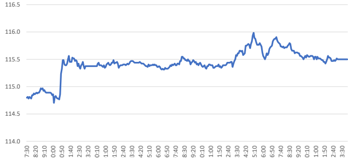
10-Year US Treasury Future