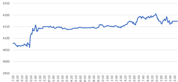
S&P 500 Future