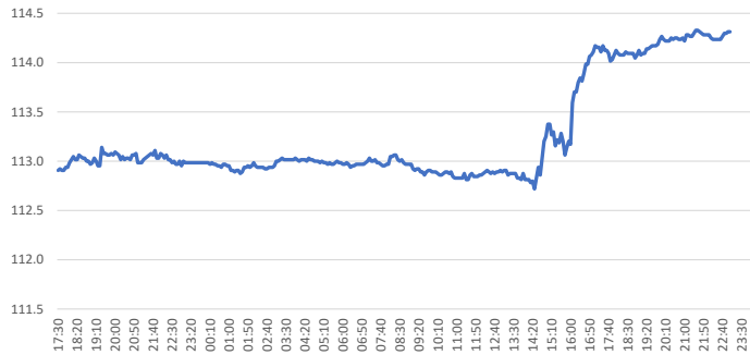
10-Year US Treasury Future