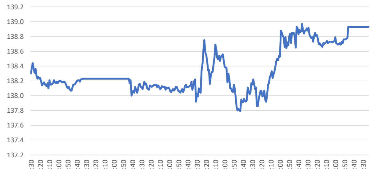
10-Year Bund Future