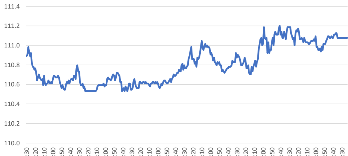
10-Year US Treasury Future