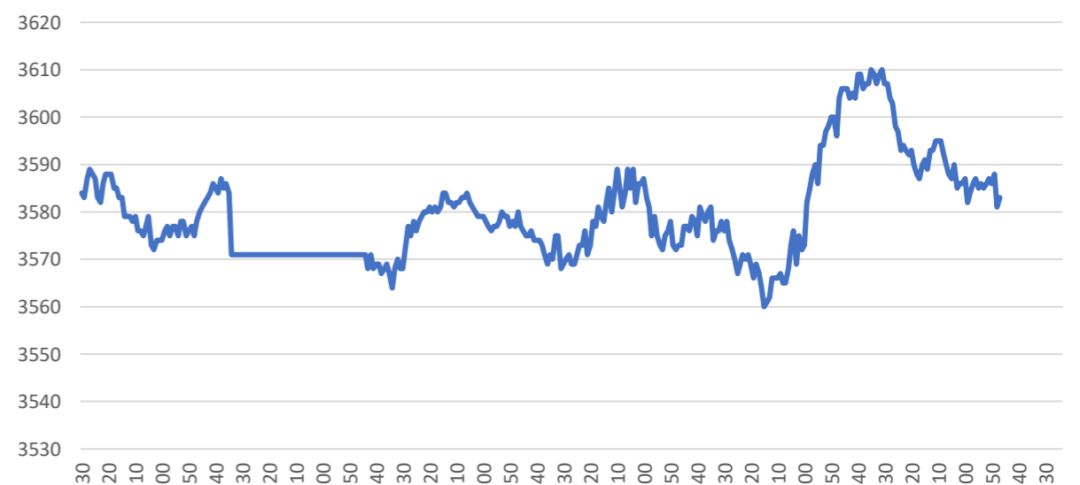
EURO STOXX 50 Future