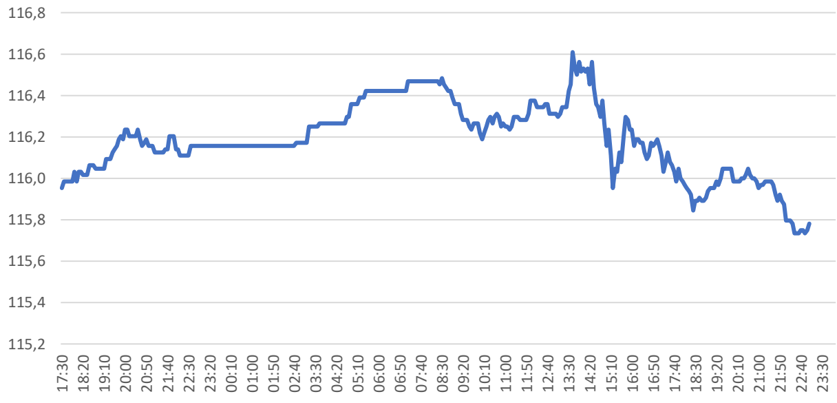
10-Year US Treasury Future