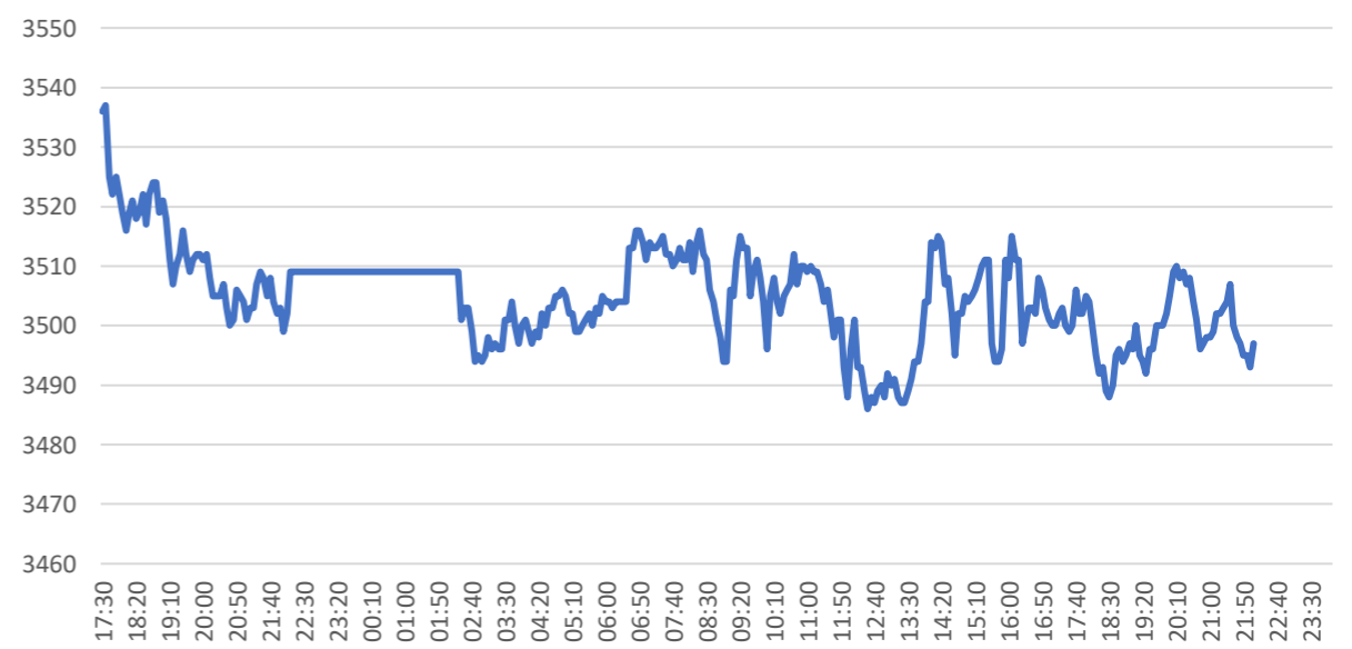
EURO STOXX 50 Future