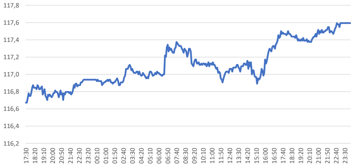
10-Year US Treasury Future