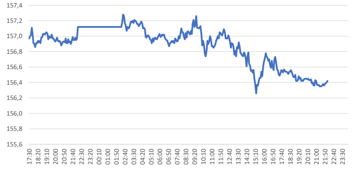
10-Year Bund Future