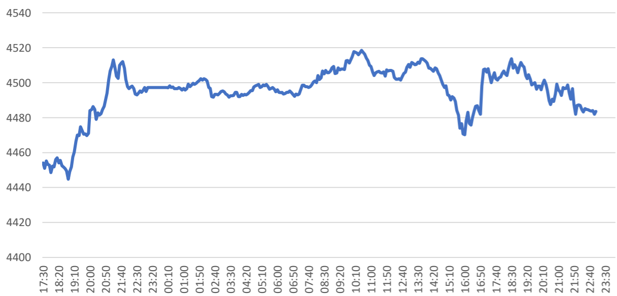
S&P 500 Future