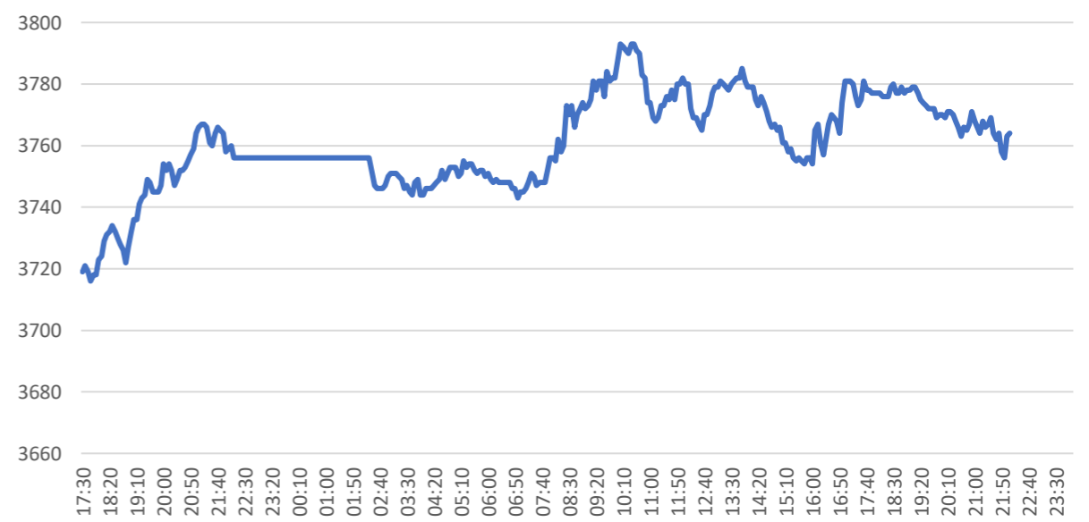
EURO STOXX 50 Future