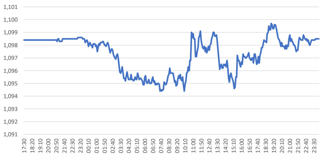
€/ $ Spot