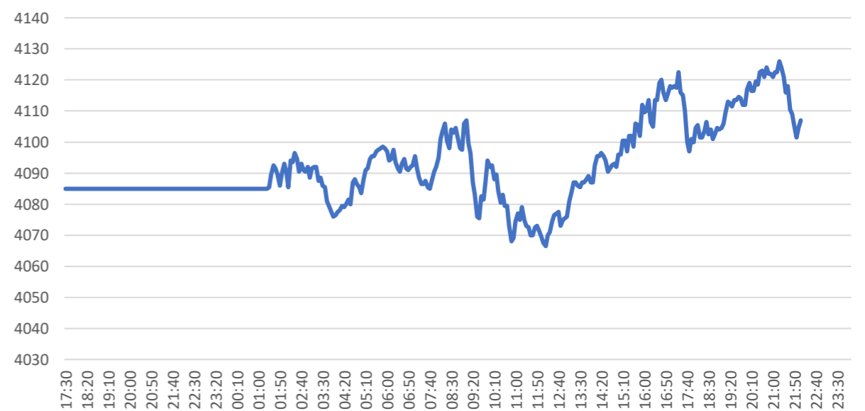
EURO STOXX 50 Future