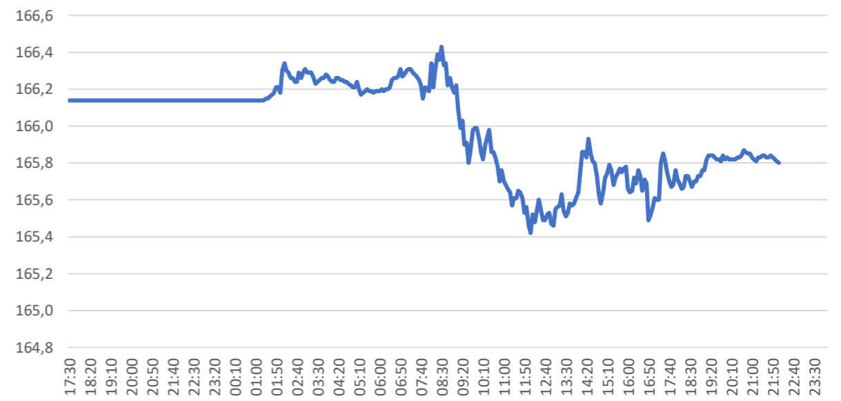
10-Year Bund Future