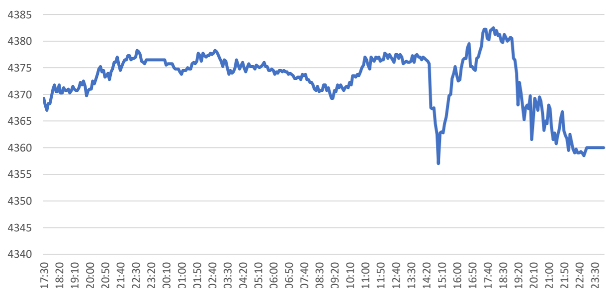
S&P 500 Future