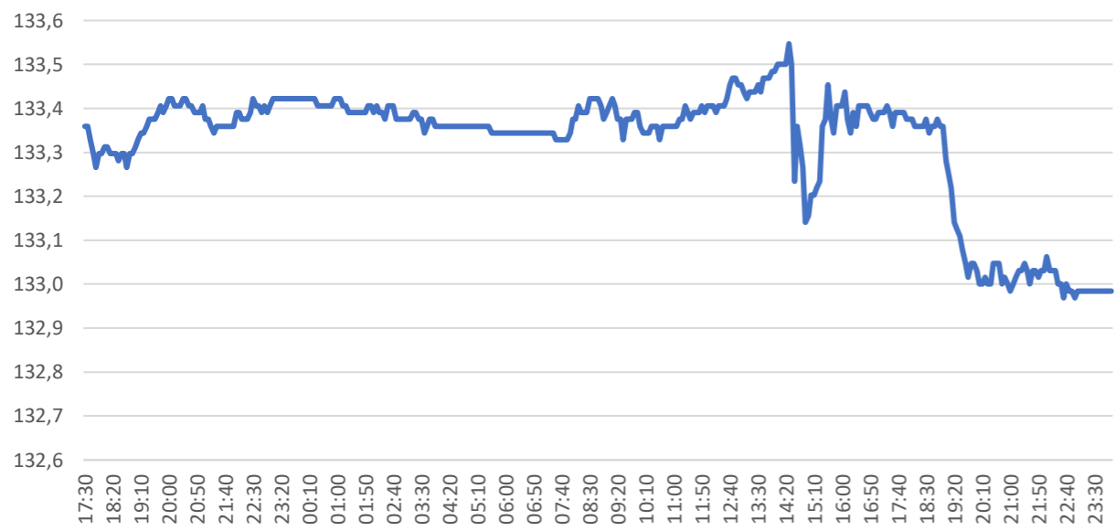
10-Year US Treasury Future