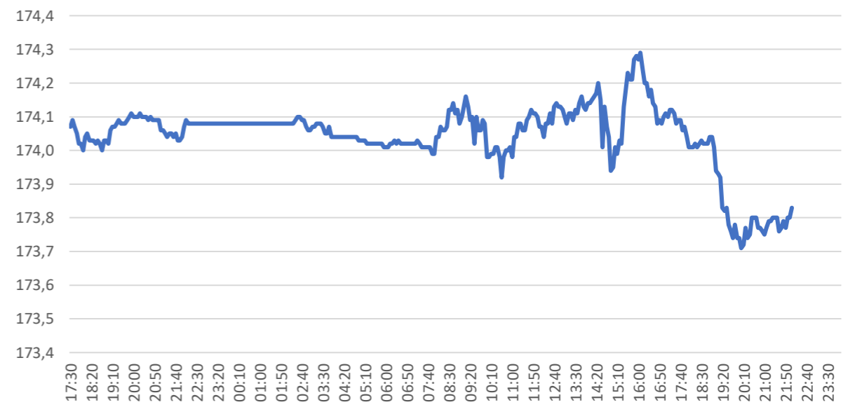
10-Year Bund Future