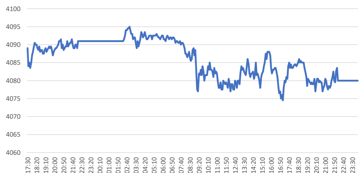
EURO STOXX 50 Future