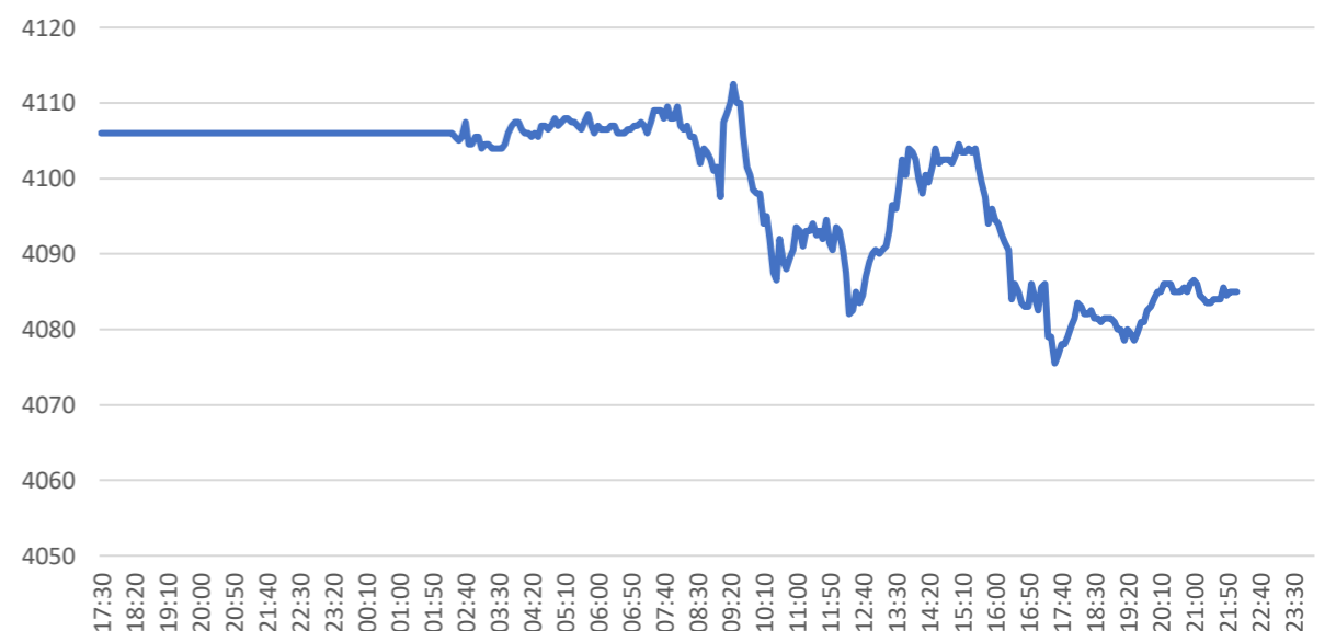
EURO STOXX 50 Future