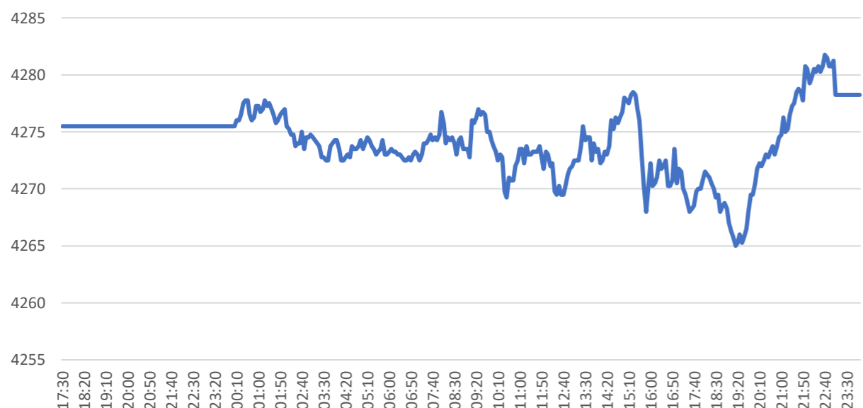
S&P 500 Future