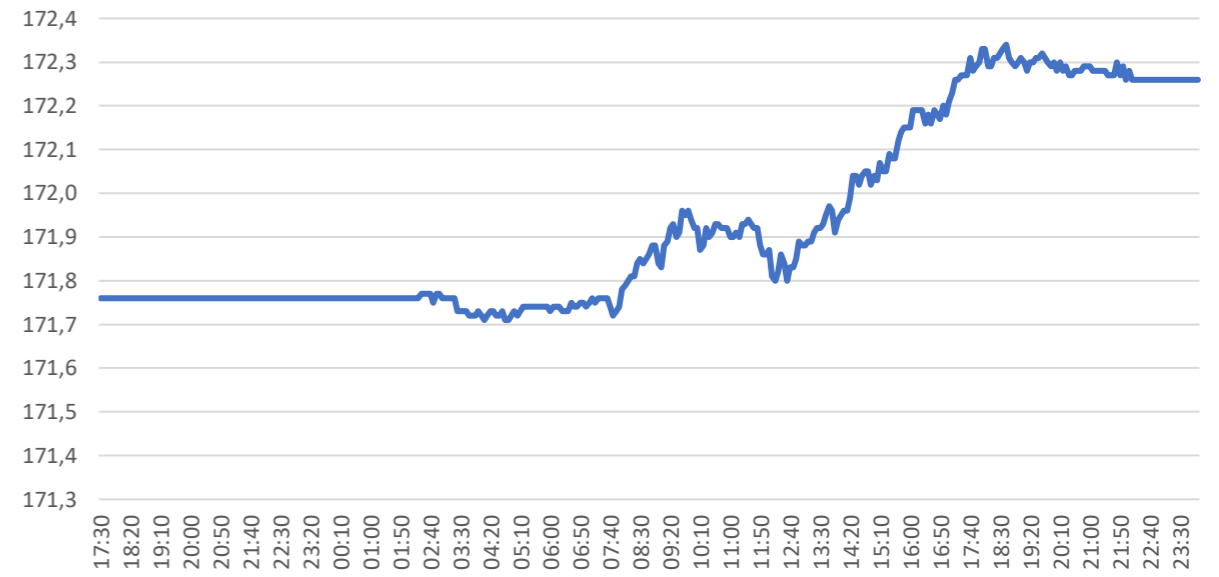
10-Year Bund Future