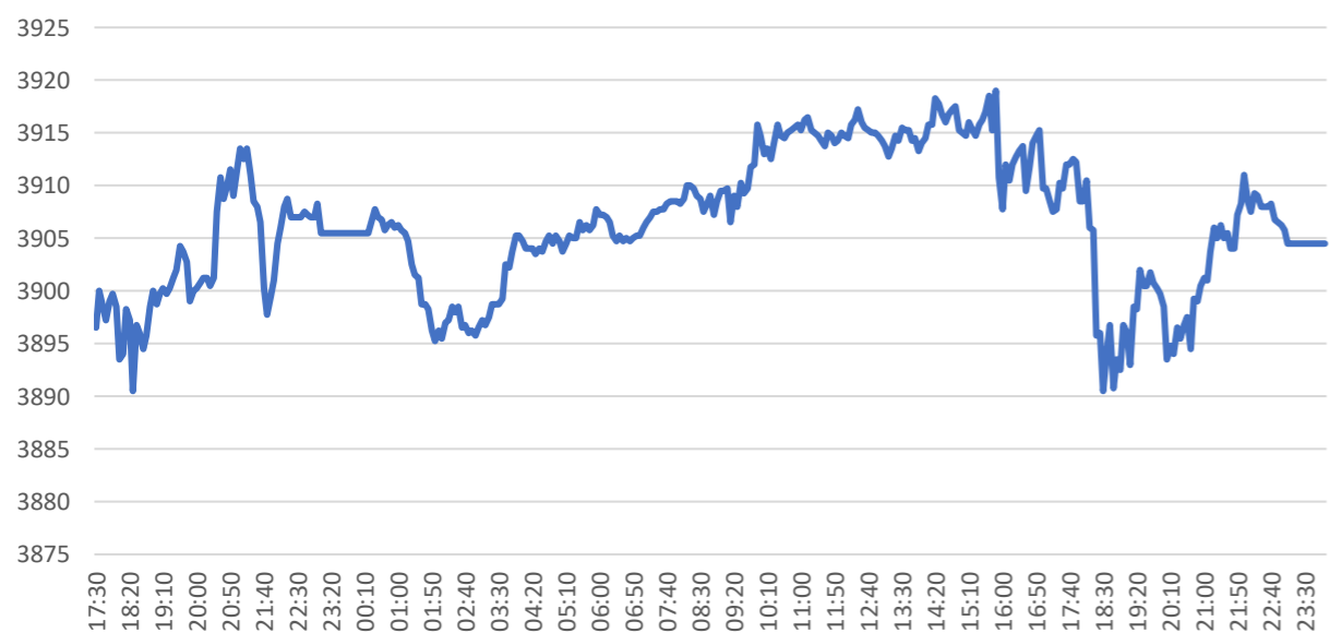
S&P 500 Future