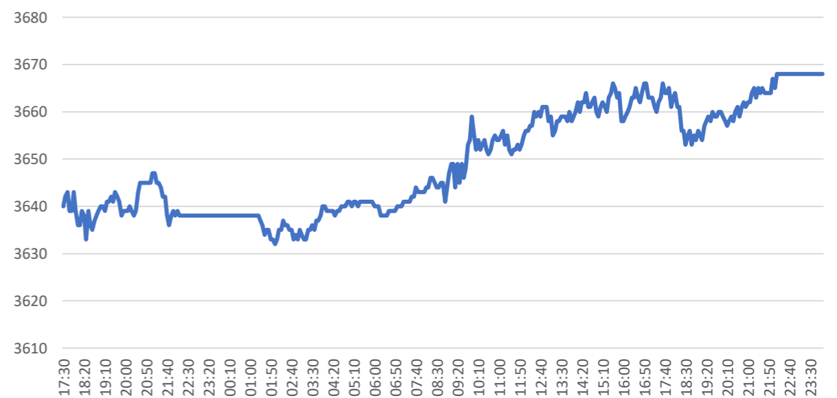
EURO STOXX 50 Future