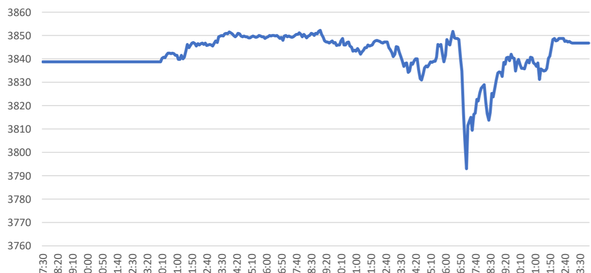
S&P 500 Future