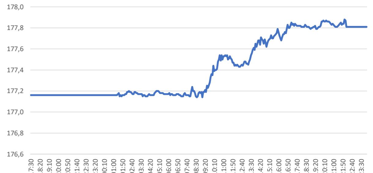
10-Year Bund Future