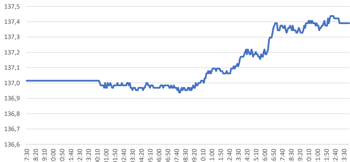
10-Year US Treasury Future