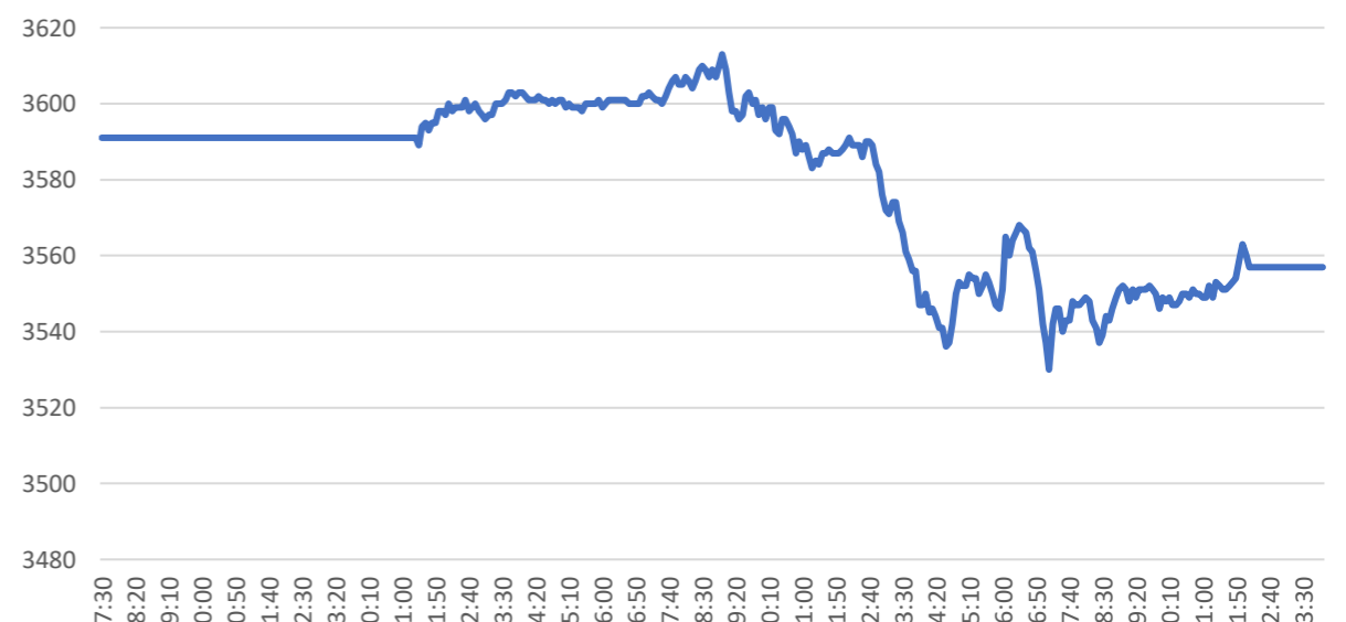
EURO STOXX 50 Future