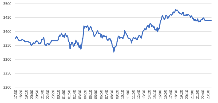
S&P 500 Future