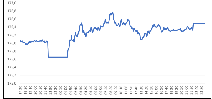
10-Year Bund Future