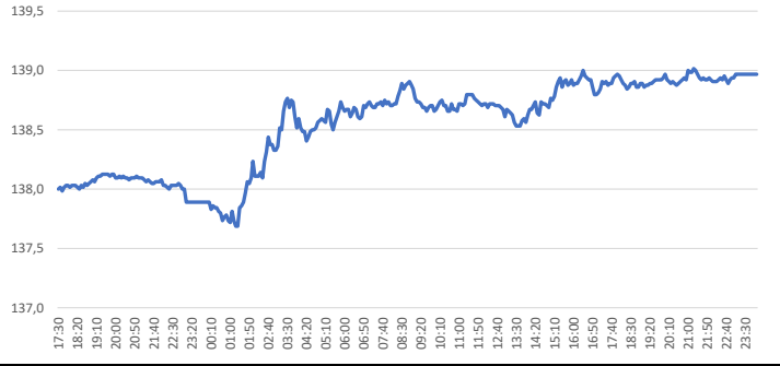
10-Year US Treasury Future