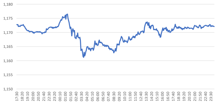
€/ $ Spot