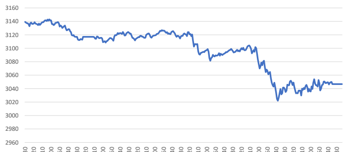
S&P 500 Future