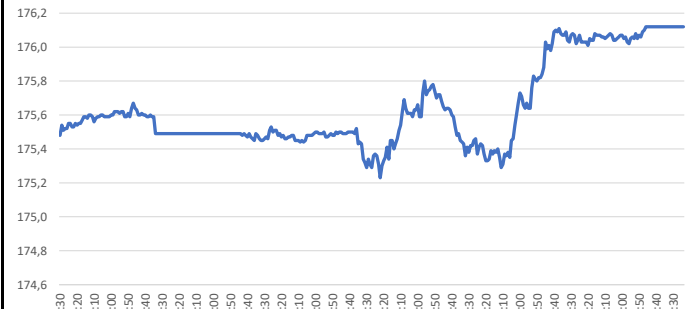
10-Year Bund Future