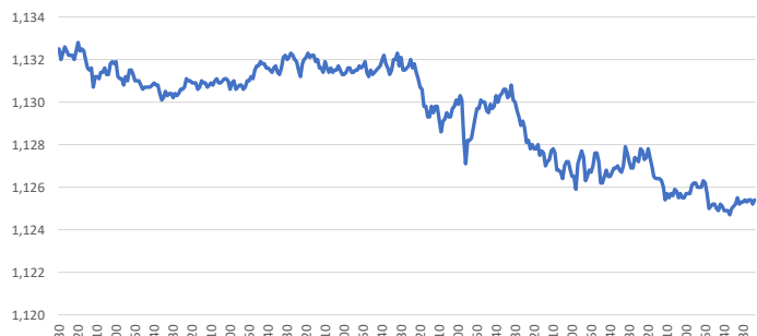
€/ $ Spot