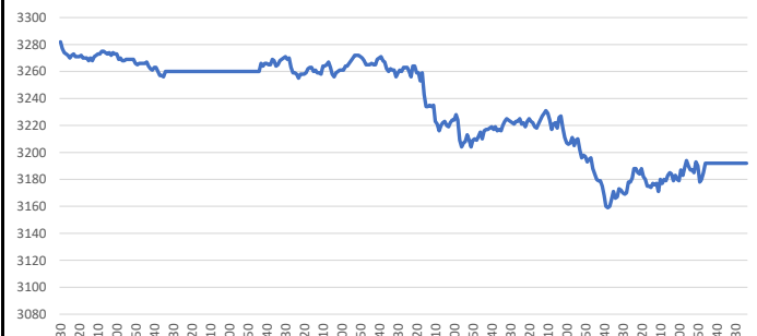
EURO STOXX 50 Future