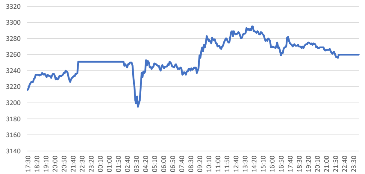
EURO STOXX 50 Future