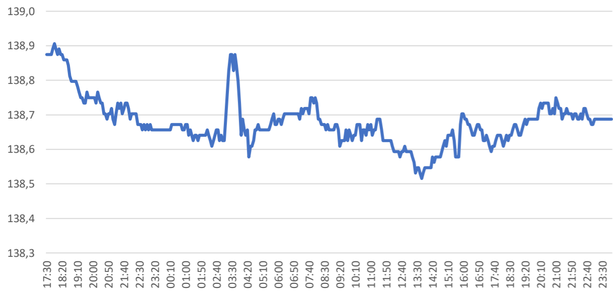
10-Year US Treasury Future