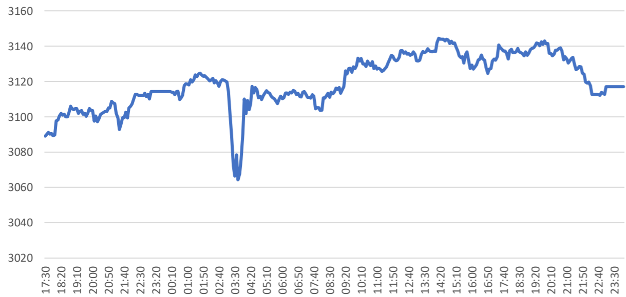
S&P 500 Future