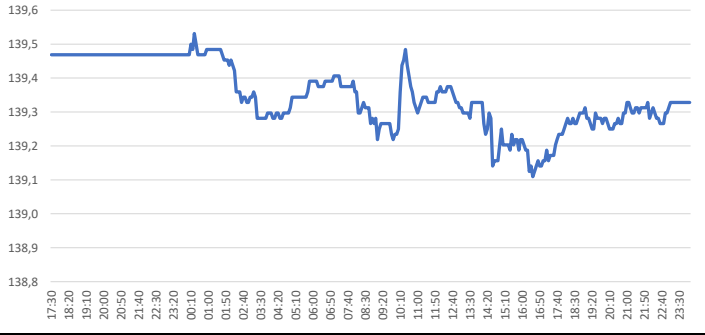
10-Year US Treasury Future