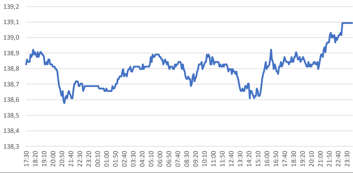
10-Year US Treasury Future