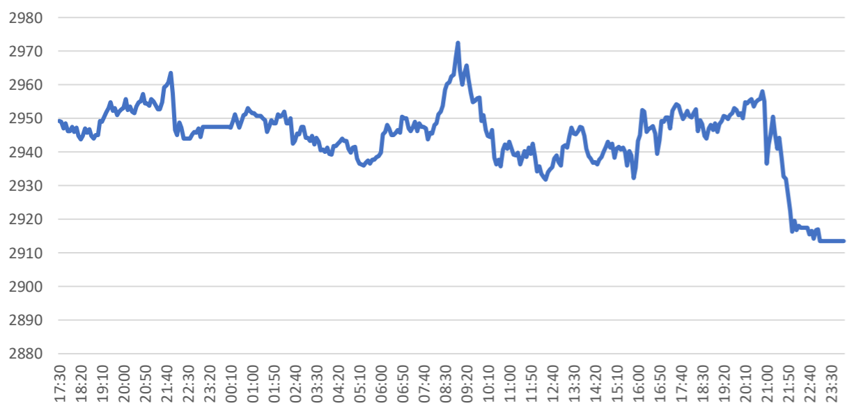
S&P 500 Future