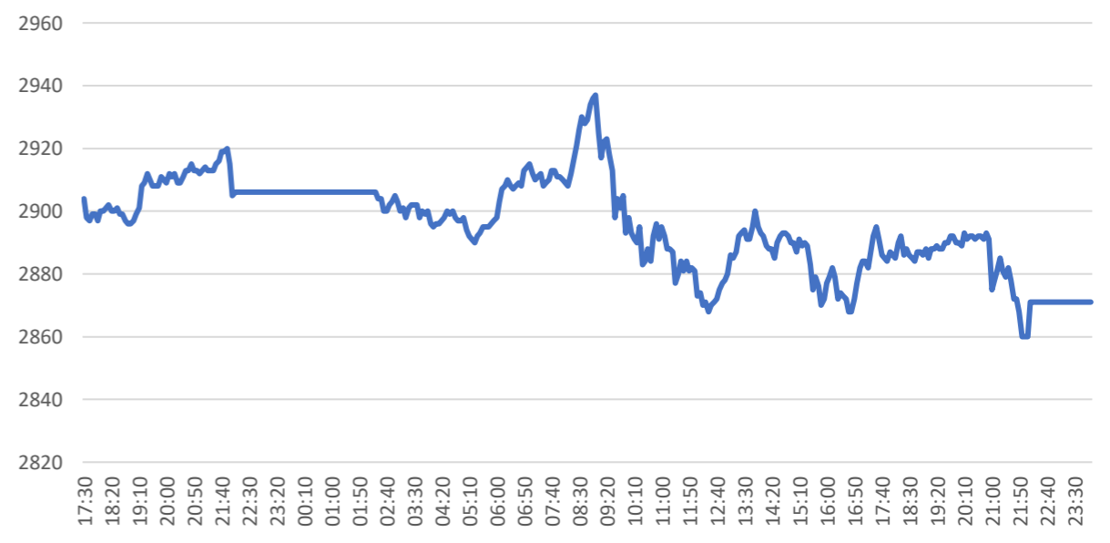
EURO STOXX 50 Future