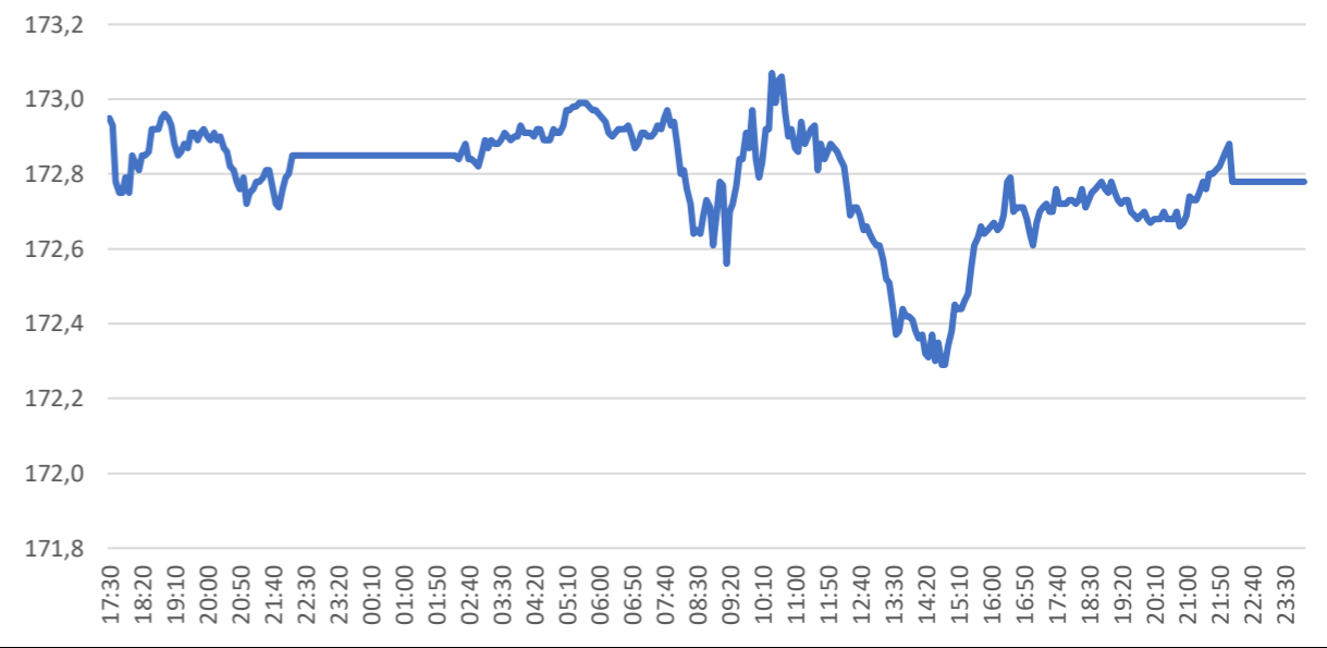
10-Year Bund Future