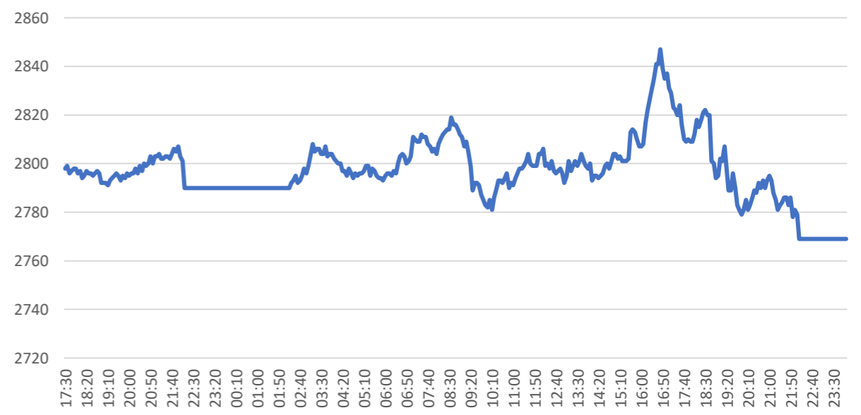
EURO STOXX 50 Future