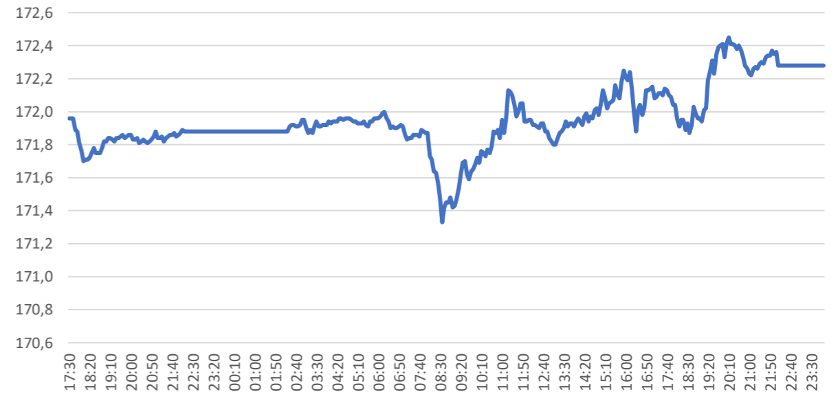
10-Year Bund Future