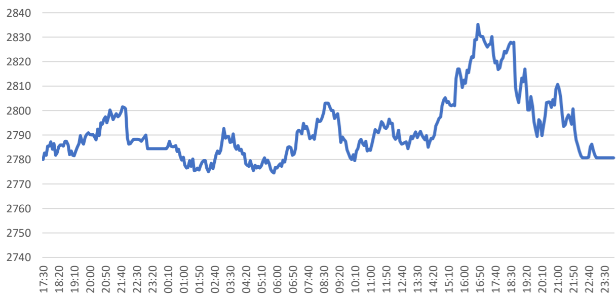
S&P 500 Future