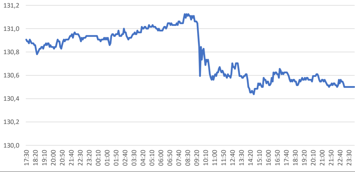
10-Year US Treasury Future