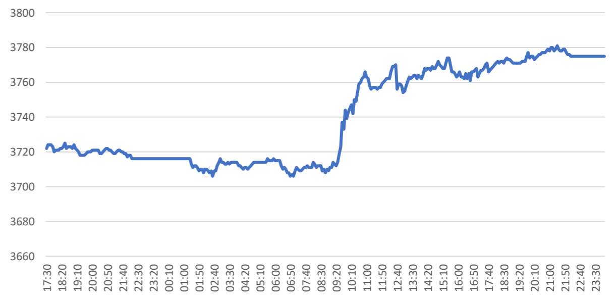
EURO STOXX 50 Future