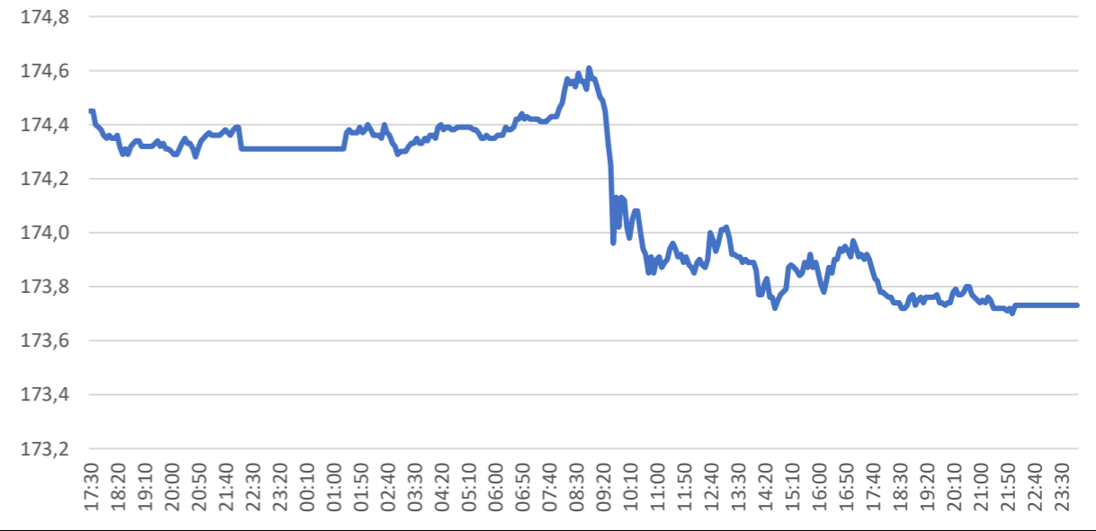
10-Year Bund Future