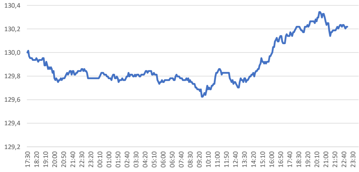
10-Year US Treasury Future