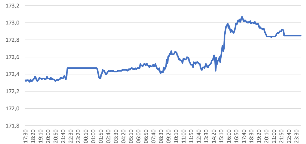
10-Year Bund Future