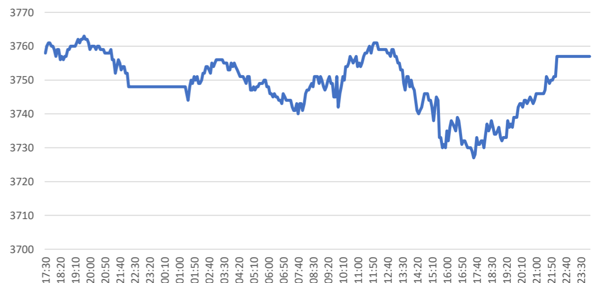
EURO STOXX 50 Future