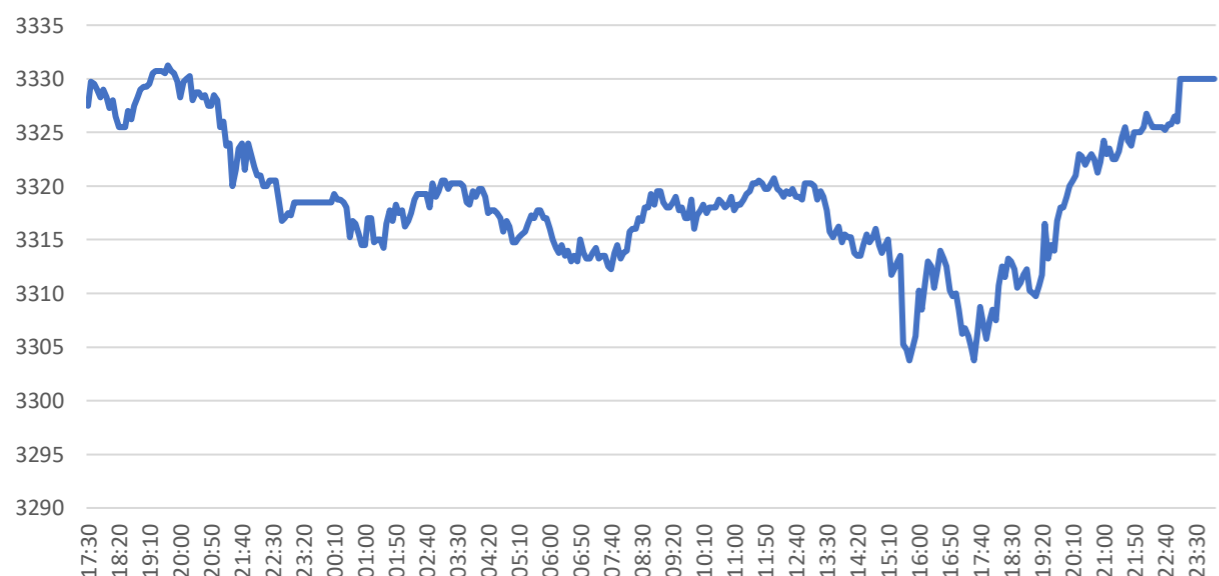
S&P 500 Future