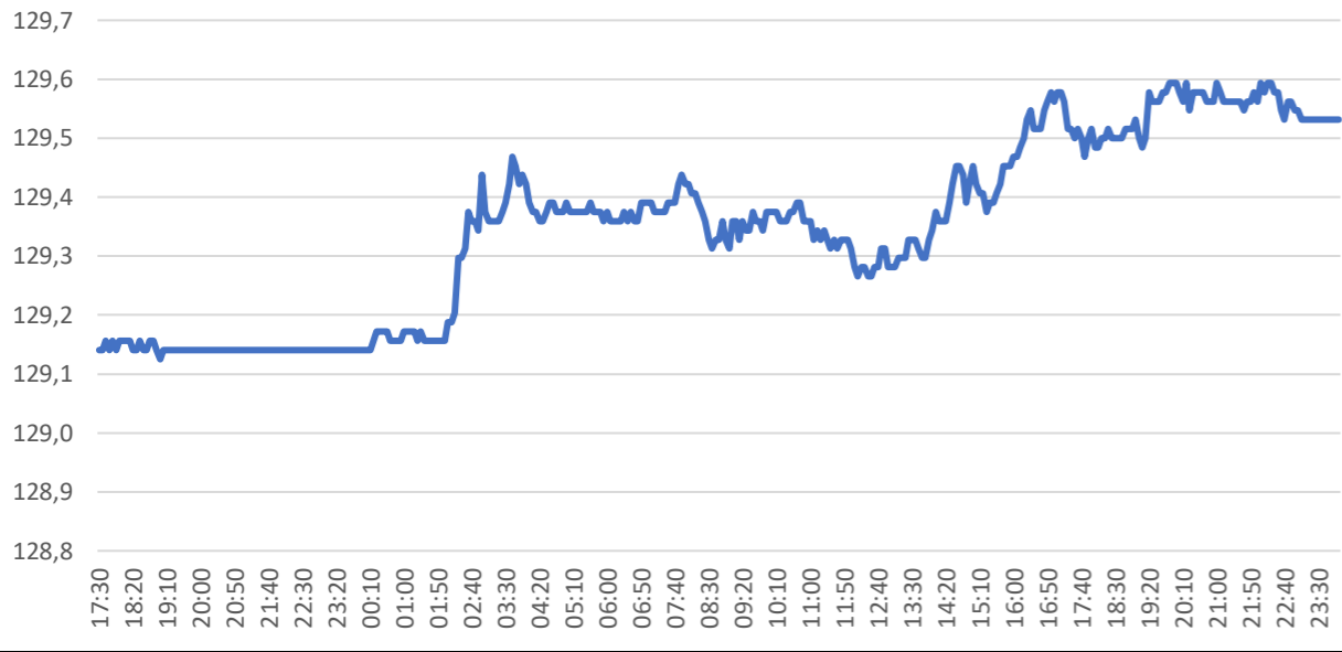
10-Year US Treasury Future