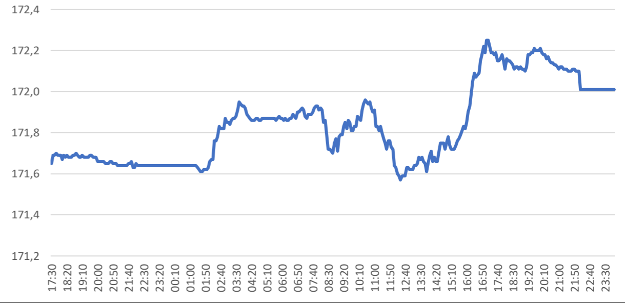
10-Year Bund Future