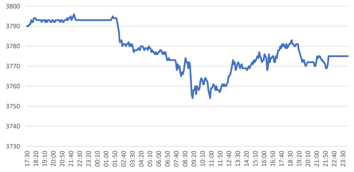
EURO STOXX 50 Future