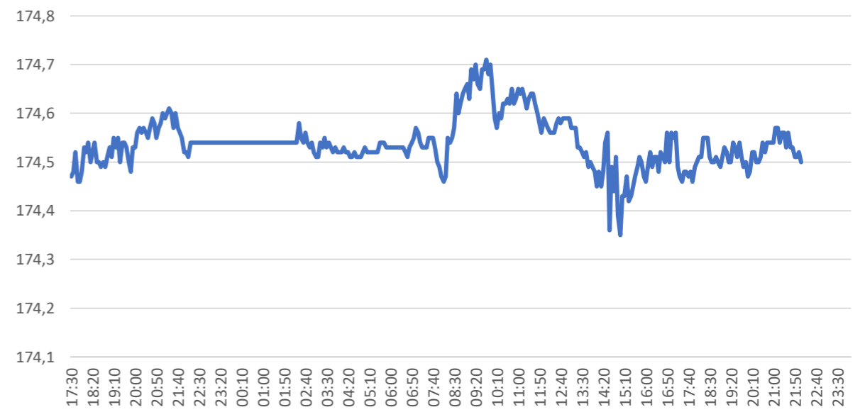
10-Year Bund Future