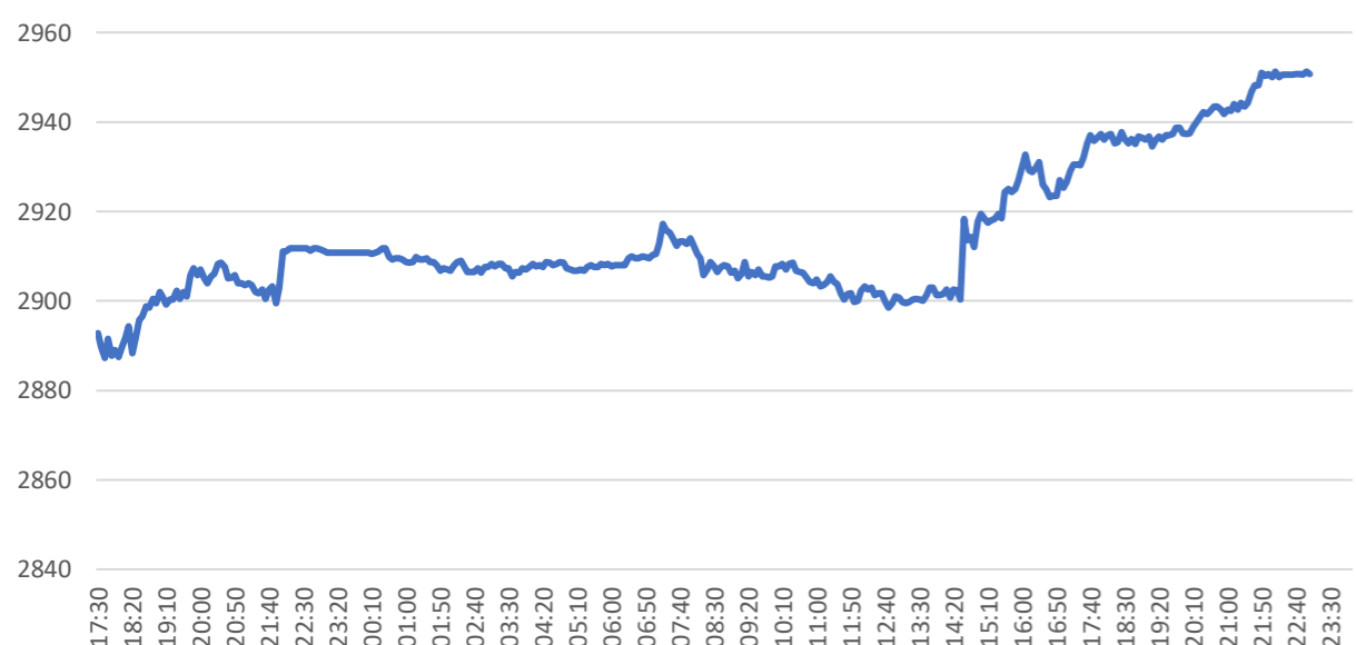
S&P 500 Future