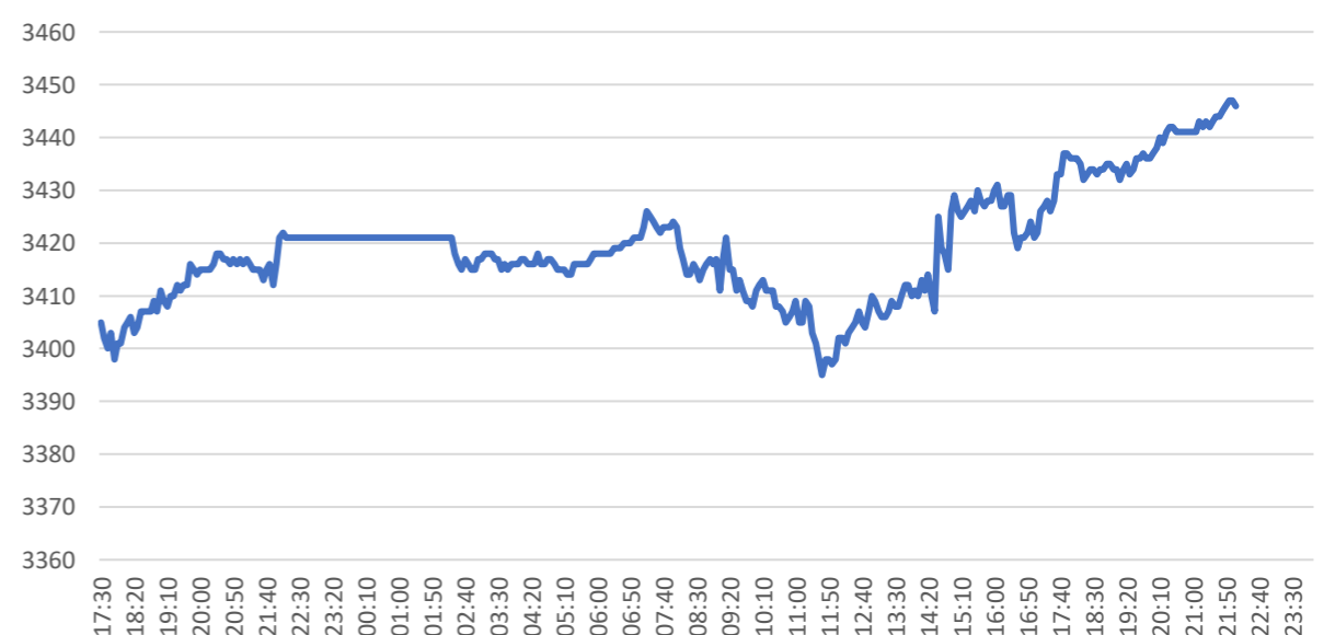
EURO STOXX 50 Future