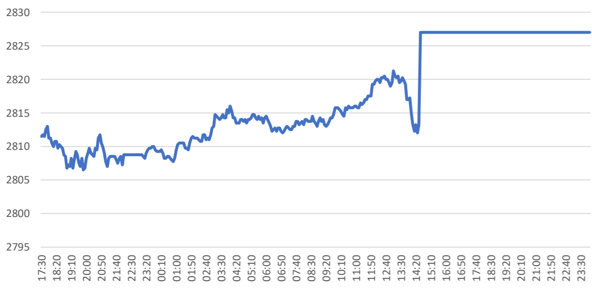
S&P 500 Future