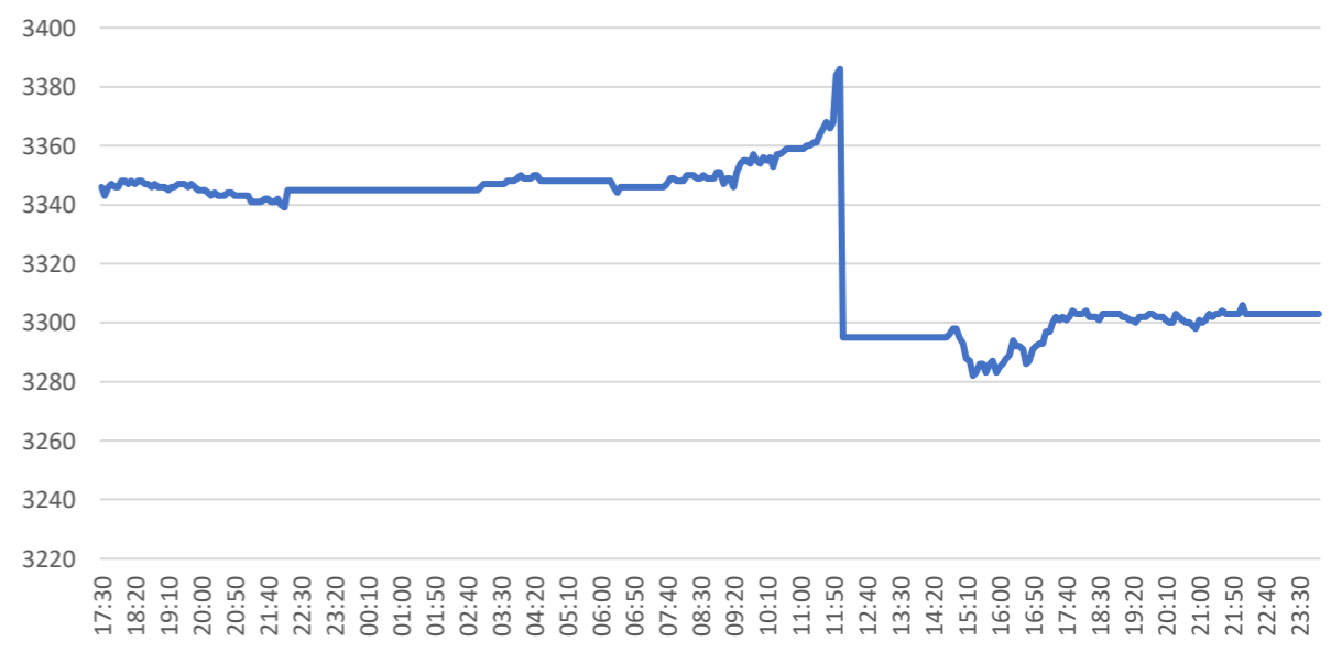
EURO STOXX 50 Future