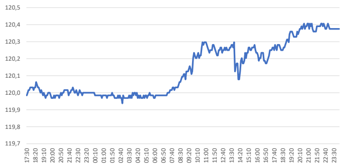
10-Year US Treasury Future