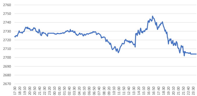
S&P 500 Future