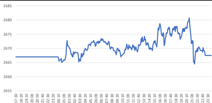
S&P 500 Future