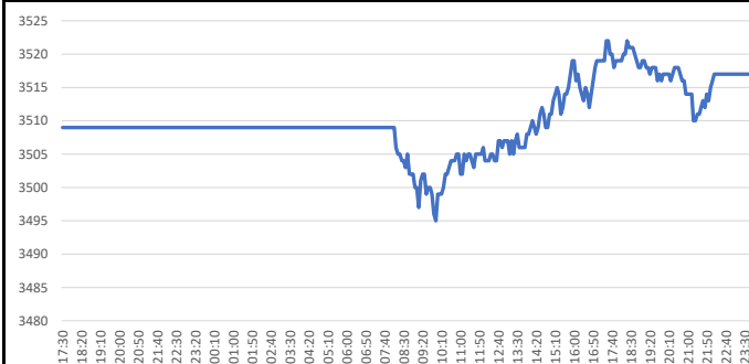
EURO STOXX 50 Future