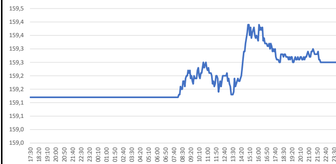
10-Year Bund Future