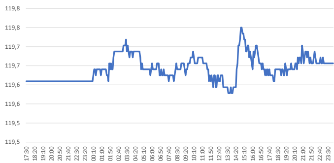
10-Year US Treasury Future