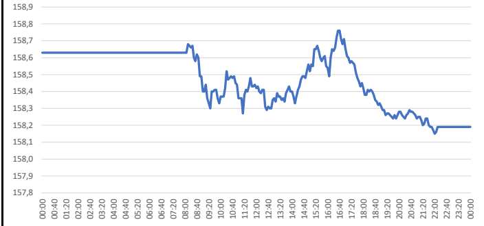
10-Year Bund Future